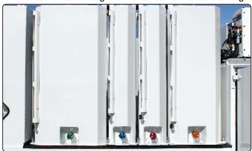
Optional quick fill available