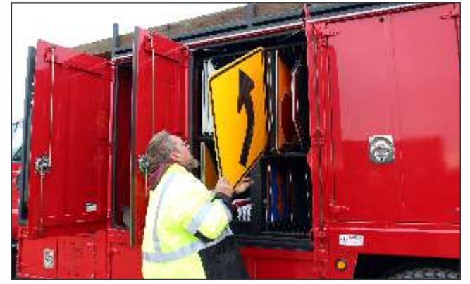
WE CREATE SPACE for sign, post and tool storage. Room for everything you need to get the job done!

access, Class 4 hitch rated to 10,000# gtw, and 1,500# tongue weight.