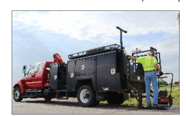
LIFT GATES assist with loading and unloading heavy equipment needed for the job!