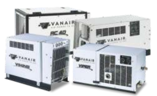
AIR COMPRESSOR UNITS: Maintainer Sign Trucks can accommodate a wide variety of reciprocating & rotary screw models powered by hydraulic, fuel or PTO.