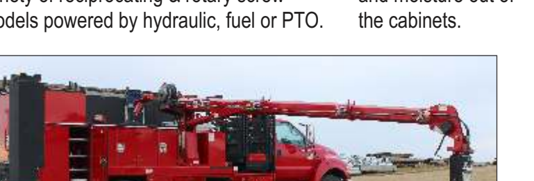
HYDRAULIC AUGERS make sign installation a one-man job!