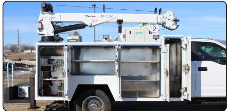
190592 - 11' long aluminum body with EH5520 short tower crane with 5500 lb. max capacity and hyd. extend 10'-20'.