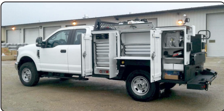
190367 - 9' long aluminum body with 52" high x 16" deep compartments.