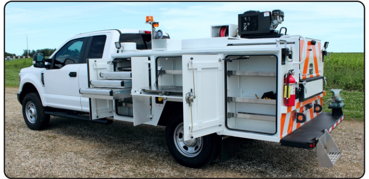
180160 - 9' long aluminum body with 42" high x 16" deep compartments.