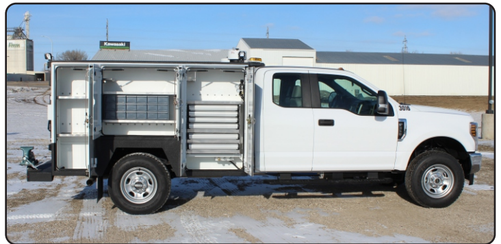
180621 - 9' long aluminum body with 60" high x 16" deep compartments.