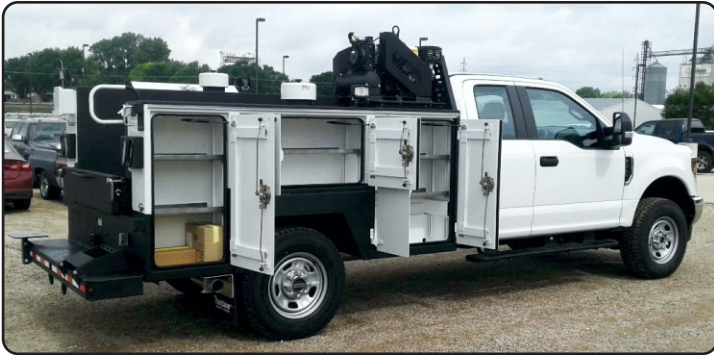
190297 - 9' long aluminum body with 52" high x 16" deep compartments.

Designed for Safety, Efficiency, and Profitability