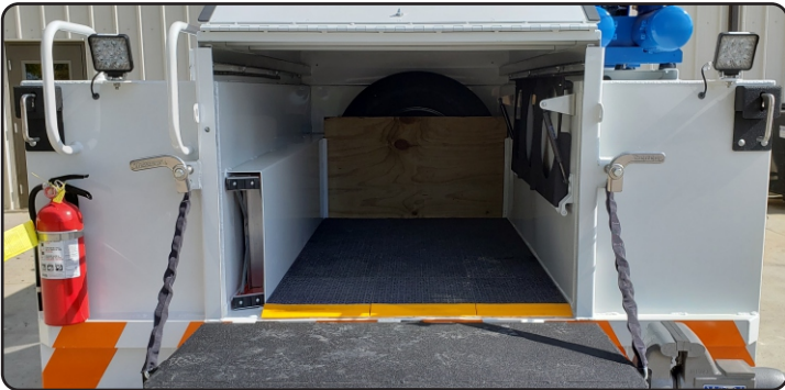
190377- 9' long aluminum body with covered center deck compartment.