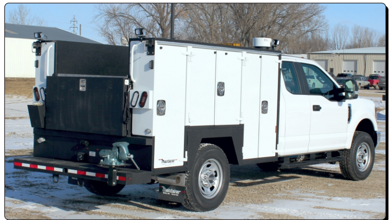
Aluminum service body only - with 60" cabinets

Must be cab chassis, not available in pickup box delete