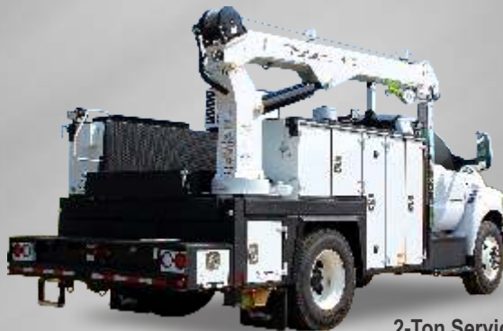
2-Ton Service Body with H10025 Crane

Chassis requires minimum 22,500 GVWR or minimum 34,000 on tandem axle.