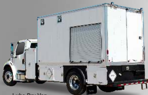
Lube Dry Van