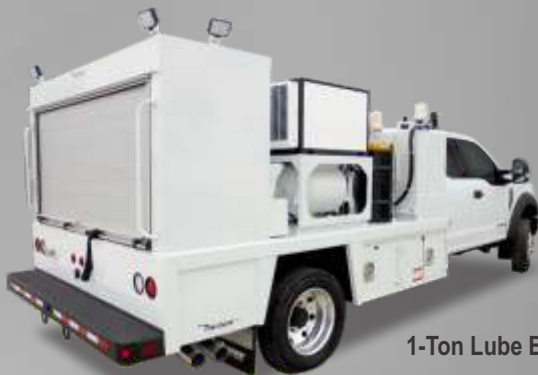
1-Ton Lube Body

Maintainer's latest Lube Truck Design SAVES WEIGHT , allowing you to maximize payload and stay ROAD LEGAL