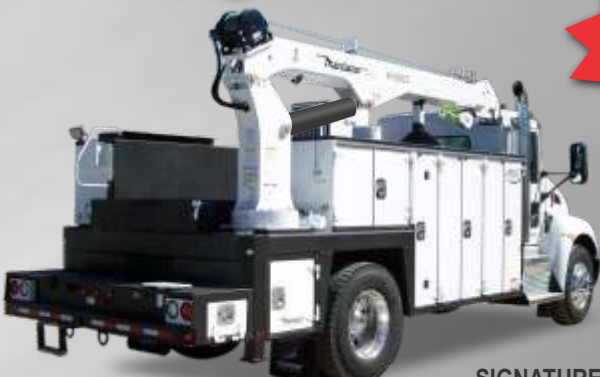
SIGNATURE SERIES 3