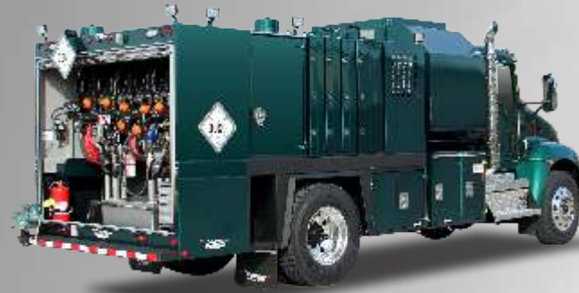
2-Ton Lube Single Axle