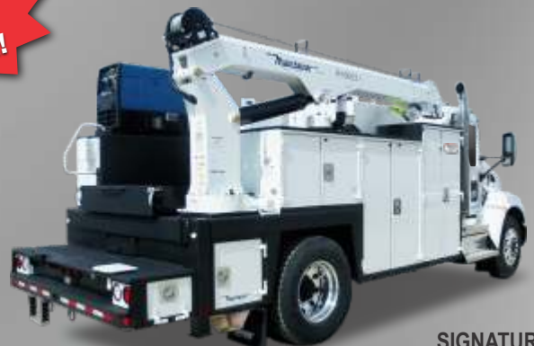
SIGNATURE SERIES 5