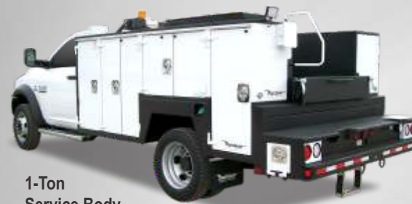
1-Ton Service Body