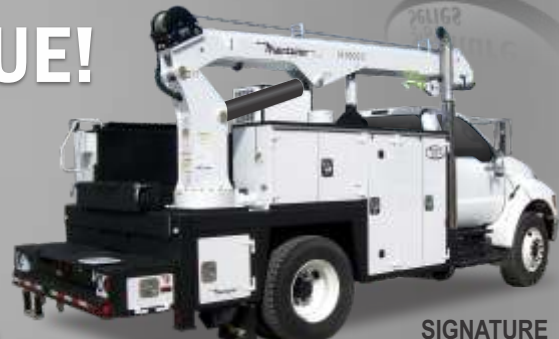
SIGNATURE SERIES 2