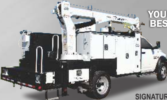
SIGNATURE SERIES 1