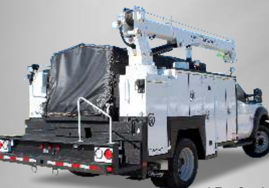
1-Ton Service Body with H6520 Crane & Soft Top Sliding Cover

Maintainer service bodies are built to meet the most rugged on/off road conditions