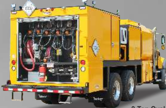
2-Ton Oval Lube with Tandem Axle

Maintainer lube trucks improve SAFETY, ERGONOMICS, & EFFICIENCY!