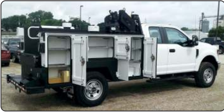
190297 - 9' long aluminum body with 52" high x 16" deep compartments.

Designed for Safety, Efficiency, and Profitability