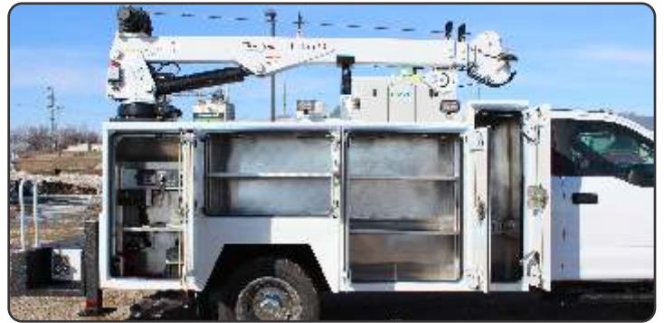
190592 - 11' long aluminum body with EH5520 short tower crane with 5500 lb. max capacity and hyd. extend 10'-20'.