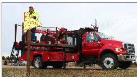
Hydraulic Catwalks for easy access