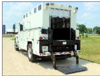
Enclosed Service Body With Lift Gate