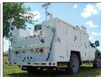
Public Road Side Assistance