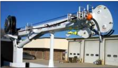
Boom Tip Hydraulics