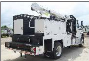
Sign Maintenance Truck