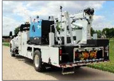
City Road Plate Maintenance