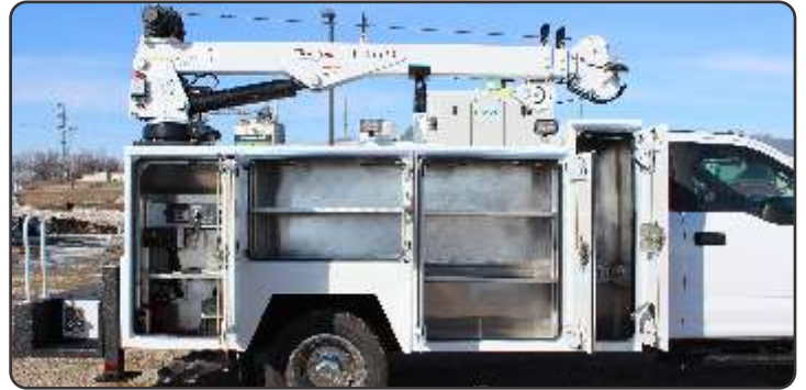
190592 - 11' long aluminum body with EH5520 short tower crane with 5500 lb. max capacity and hyd. extend 10'-20'.