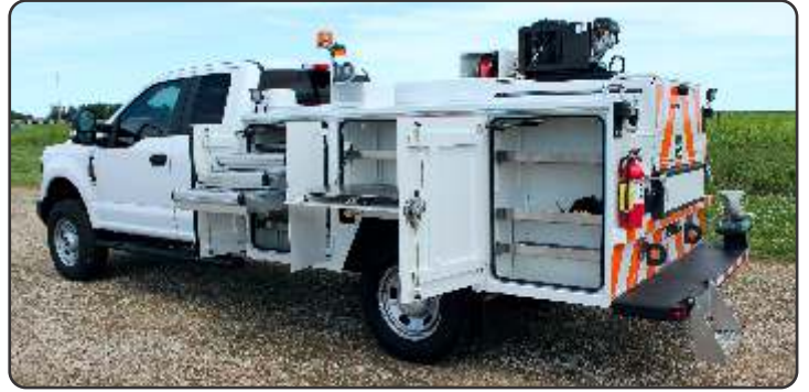
180160 - 9' long aluminum body with 42" high x 16" deep compartments.