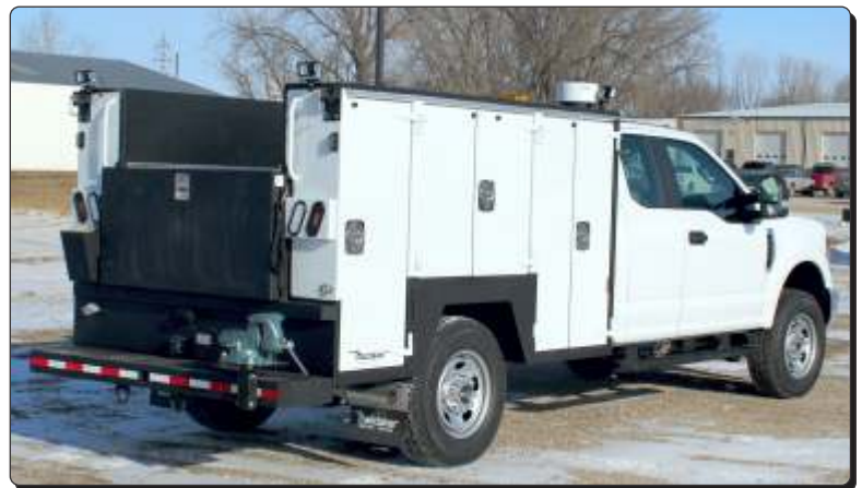
Aluminum service body only - with 60" cabinets

Must be cab chassis, not available in pickup box delete