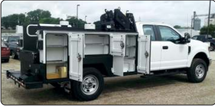
190297 - 9' long aluminum body with 52" high x 16" deep compartments.

Designed for Safety, Efficiency, and Profitability