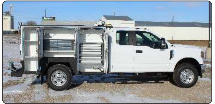
180621 - 9' long aluminum body with 60" high x 16" deep compartments.