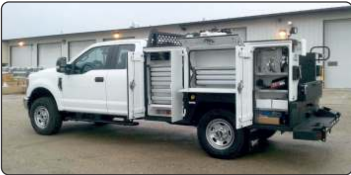
190367 - 9' long aluminum body with 52" high x 16" deep compartments.