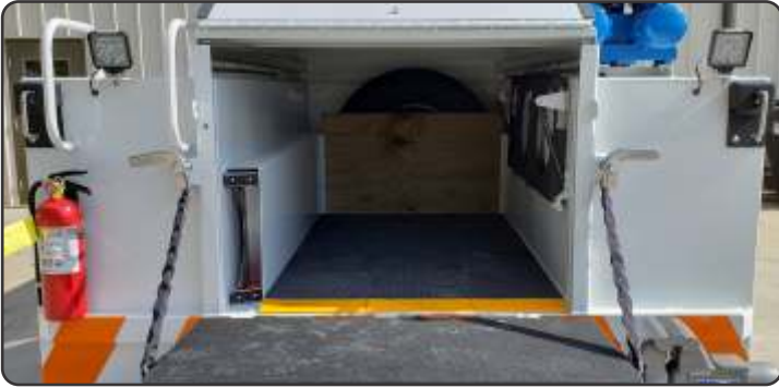
190377- 9' long aluminum body with covered center deck compartment.